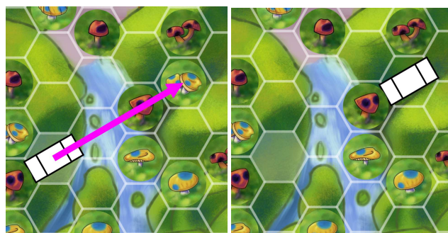
Example: Player A moves the basket in a straight line and takes a 4-point mushroom

At the end of your turn, leave the basket pointing in the direction you've moved (so the next player knows which line of movement is forbidden).